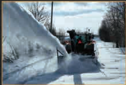
ROTATING FAN HOUSING / SIDE DISCHARGE