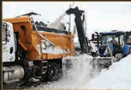
TRUCK LOADING CHUTE