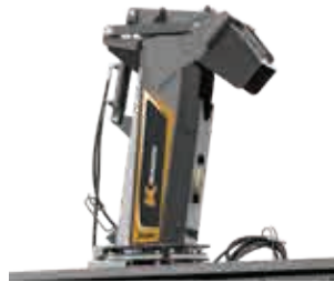
HYDRAULIC CHUTE & MULTI-HINGE DEFLECTOR