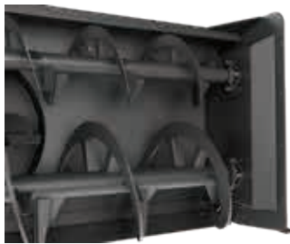
TWIN AUGER CHAIN DRIVE