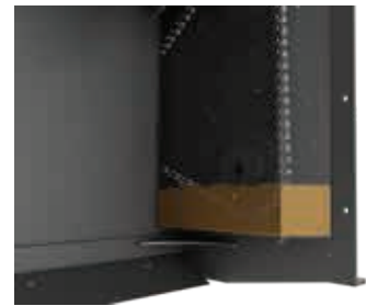
OIL CHAIN BATH