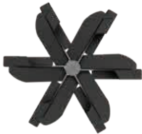
6 BLADE FAN