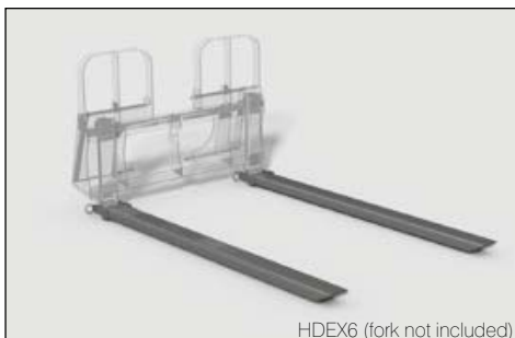
HDEX6 (fork not included)