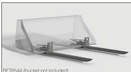
BFT6544 (bucket not included)