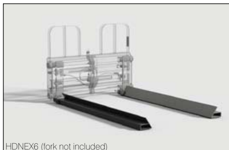
HDNEX6 (fork not included)