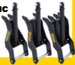
PROGRESSIVE HYDRAULIC THUMB