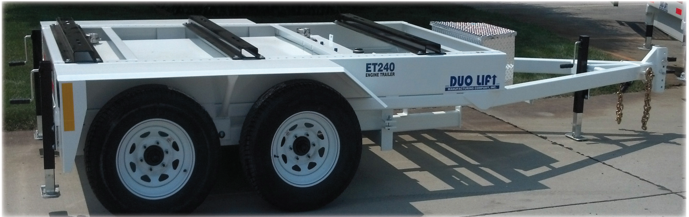
MODEL SHOWN: ET240 OFF-ROAD ENGINE TRAILER WITH OPTIONAL EQUIPMENT