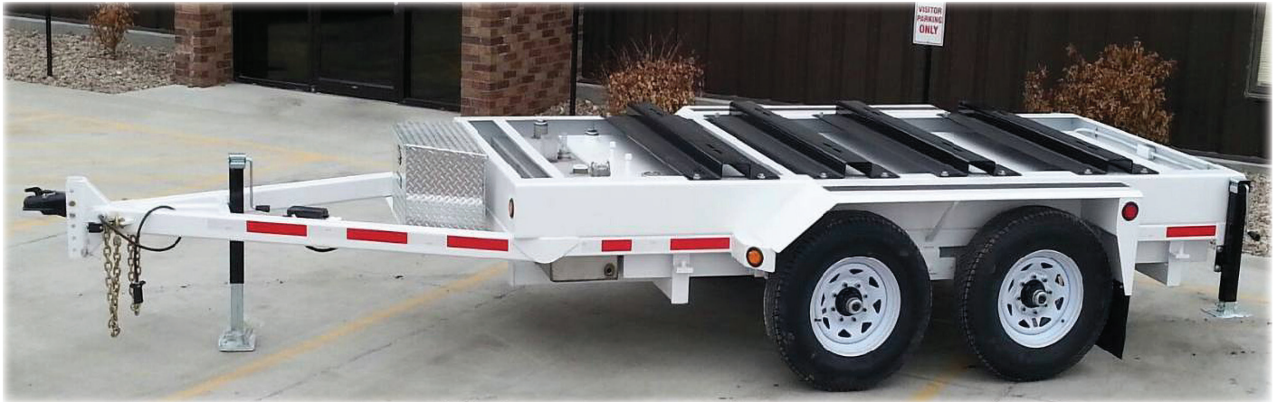
MODEL SHOWN: ET440D ENGINE TRAILER (DOT COMPLIANT)