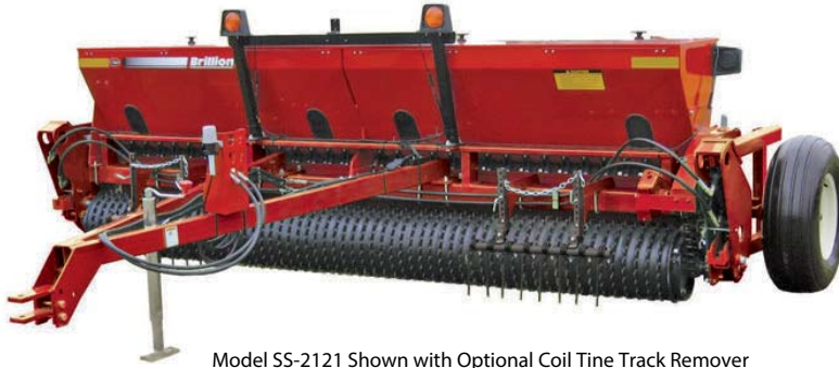
Model SS-2121 Shown with Optional Coil Tine Track Remover

The SS Series High Capacity Seeders are built with many of the same features as the Standard Series and the Mid-Size Series Ag Seeders. A larger seed box capacity with narrow meter spacing provides the ultimate in high efficiency seeding. These units offer the proven Sure Stand concept in both three-point hitch and pull-type models. Pull-type models include all hydraulic equipment including new implement tires. Additional seed boxes are not an option on these High Capacity Series models.