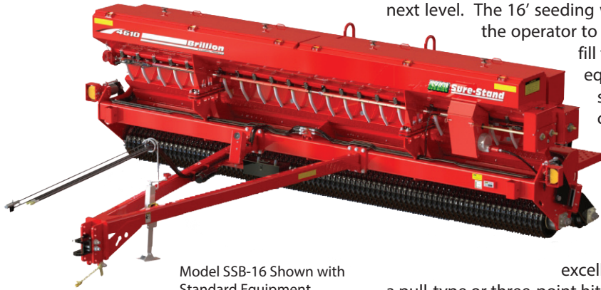
Model SSB-16 Shown with Standard Equipment

The 4610-16 Agricultural Seeder takes the popular Sure Stand Ag Seeder to the next level. The 16' seeding width and 20-bushel capacity front seed box allows the operator to spend more time seeding and less time stopping to fill the seed boxes, maximizing efficiency. The seeder is equipped with the proven Micro-Meter seed metering system and is able to seed a variety of seeds at the correct depth for optimal germination. The 4610-16 features pneumatic down pressure on the rear roller for better seed coverage while squeezing out air pockets in the seedbed. The heavy-duty frame supports the larger seed boxes delivering more weight per foot on the rollers. Soil clods are easily crushed, further fine-tuning the seedbed for excellent germination rates. The 16' Seeder is available in a pull-type or three-point hitch configuration and is available with a single Micro-Meter seed box or with an additional rear brome box.