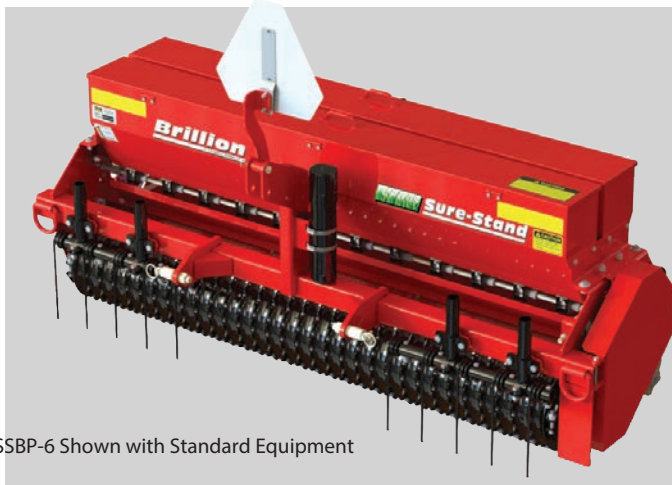
Model SSBP-6 Shown with Standard Equipment

The SS Series of Agricultural Seeders is the industry standard when it comes to planting alfalfa, canola, and grasses. The Sure Stand concept provides precision seed metering and accurate seed depth placement. This combination offers optimum germination. These 4', 5' and 6' three-point hitch models feature a front micro-metered seed box and a rear seed box with the blade agitator metering system.