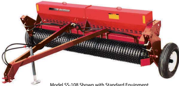
Model SS-108 Shown with Standard Equipment

The SS Series Mid-Size Seeder offers alfalfa producers the proven Sure Stand concept with larger capacity seed boxes and closer spaced seed meters for an even better distribution of seed, less time spent filling seed boxes and more time seeding. These models are available in both three-point hitch and pull-type models. Pull-type models include all hydraulic equipment including new implement tires. Brome boxes are not an option on these Mid-Size Seeders.