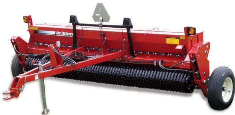
Model SSB-12 Shown with Optional Acre Meter Kit

The SS Series of Agricultural Seeders has been the industry standard when it comes to planting alfalfa, canola and grasses. The Sure Stand concept provides precision seed metering and accurate seed depth placement. This combination offers optimum germination. The Standard Series is offered in both three-point hitch and pull-type models. Pull-type models include all hydraulic equipment including new implement tires.