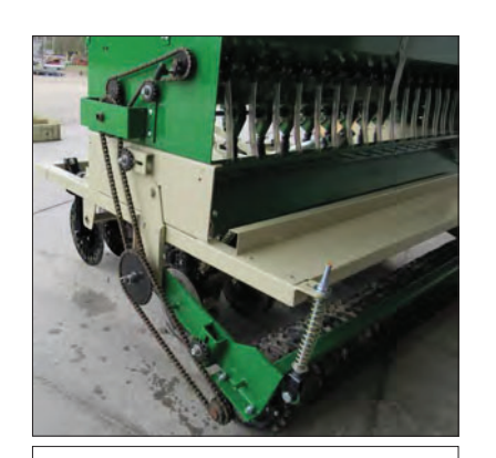
High Precision Ground Drive Seeding System.