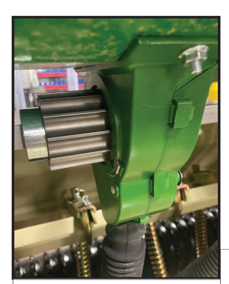
High Precision Large Seedcup