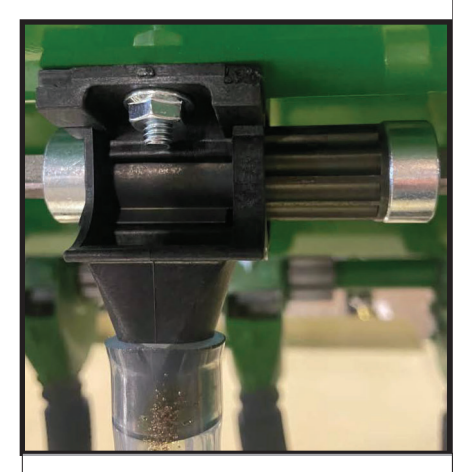
Smaller Legume Seedcup