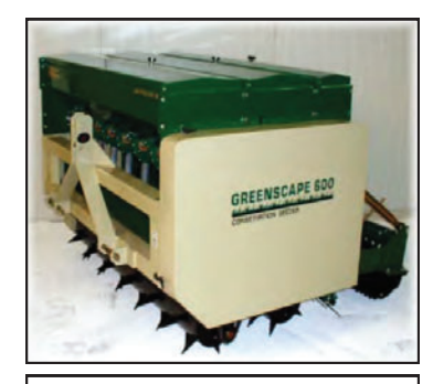
Seeder with 3 Boxes