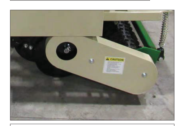
Shearpin for Seedcup Safety