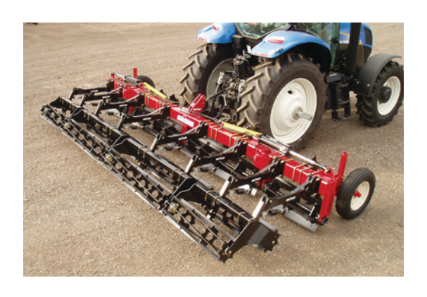
Units include shank with foot piece, 5-blade spiral reels mounted to 7x7 vertical fold toolbar, and double rolling basket. Gauge wheels are included on all models.