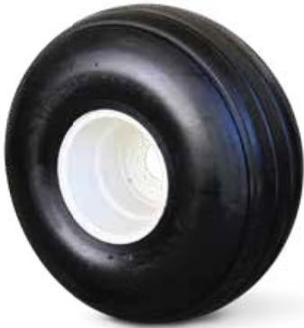
21.5 x 16.1 14 Ply