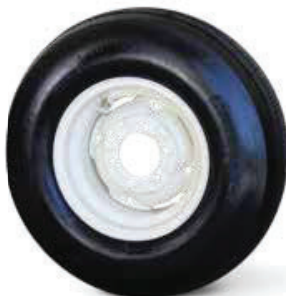
11L x 15 Load Range D