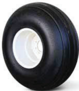
16.5 x 16.1 10 Ply