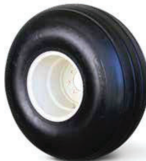
19L x 16.1 10 Ply