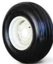
11L x 15 8 Ply