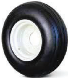
12.5L x 16 14 Ply