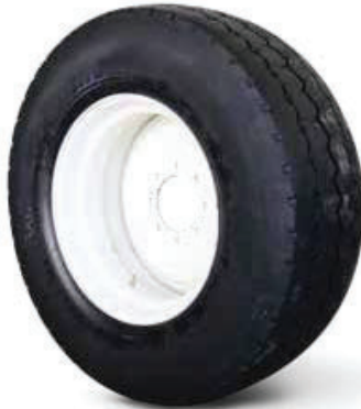
385 x 22.5 (15 x 22.5)