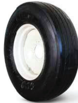
12 or 315 x 22.5