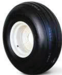
14L x 16.1 8 Ply