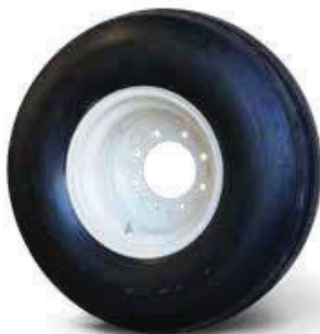
12.5L x 15 Load Range F