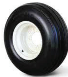
12.5L x 15 12 Ply