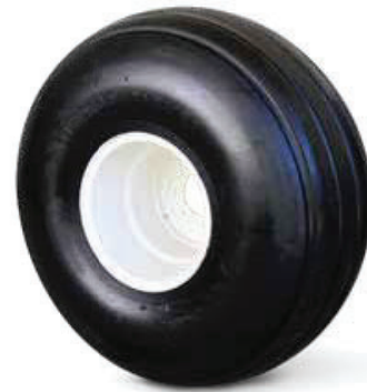
21.5 x 16.1 14 Ply

** Images shown for approximate size and profile of tire and rim package only. Relative wheel picture sizing is approximate.