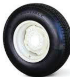
235/85 R16 Load Range F