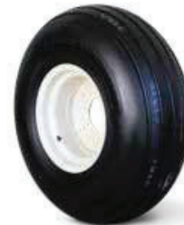
14L x 16.1 12 Ply