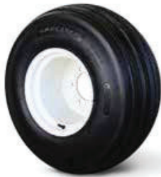
26x12 12 Ply