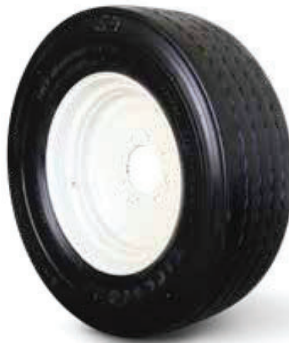
305 x 22.5