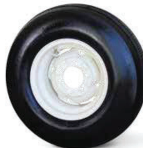
11L x 15 Load Range F