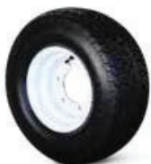
20.5 x 8-10 Load Range F