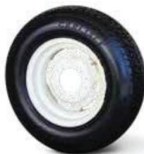
225/75 R15 Load Range D