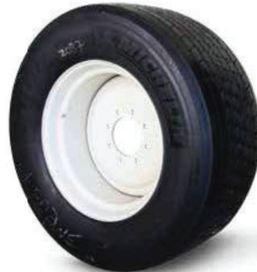
445 / 50 x 22.5