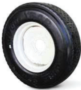
11 x 22.5

* Capacities on recap tires are approximate