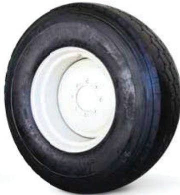
425 x 22.5 (16 x 22.5)