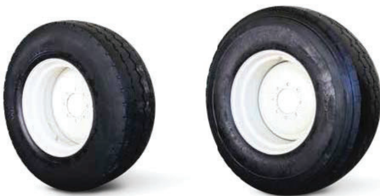
385 x 22.5 (15 x 22.5)