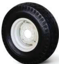
11L x 15 Load Range F