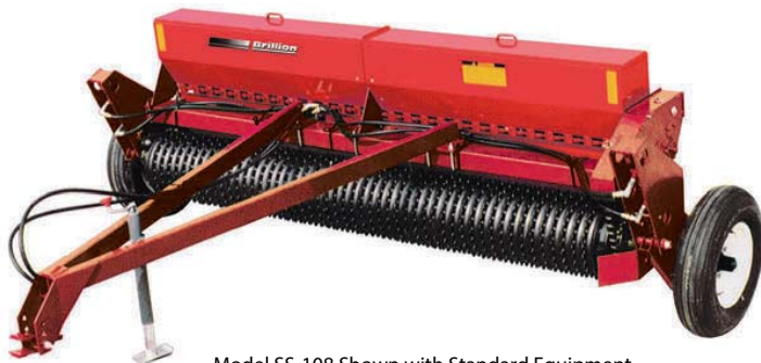
Model SS-108 Shown with Standard Equipment

The SS Series Mid-Size Seeder offers alfalfa producers the proven Sure Stand concept with larger capacity seed boxes and closer spaced seed meters for an even better distribution of seed, less time spent filling seed boxes and more time seeding. These models are available in both three-point hitch and pull-type models. Pull-type models include all hydraulic equipment including new implement tires. Brome boxes are not an option on these Mid-Size Seeders.