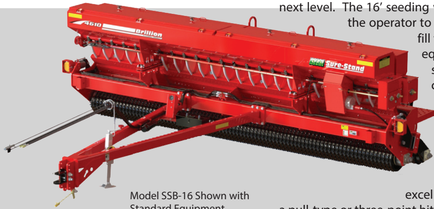
Model SSB-16 Shown with Standard Equipment

The 4610-16 Agricultural Seeder takes the popular Sure Stand Ag Seeder to the next level. The 16' seeding width and 20-bushel capacity front seed box allows the operator to spend more time seeding and less time stopping to fill the seed boxes, maximizing efficiency. The seeder is equipped with the proven Micro-Meter seed metering system and is able to seed a variety of seeds at the correct depth for optimal germination. The 4610-16 features pneumatic down pressure on the rear roller for better seed coverage while squeezing out air pockets in the seedbed. The heavy-duty frame supports the larger seed boxes delivering more weight per foot on the rollers. Soil clods are easily crushed, further fine-tuning the seedbed for excellent germination rates. The 16' Seeder is available in a pull-type or three-point hitch configuration and is available with a single Micro-Meter seed box or with an additional rear brome box.