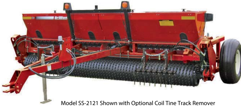
Model SS-2121 Shown with Optional Coil Tine Track Remover

The SS Series High Capacity Seeders are built with many of the same features as the Standard Series and the Mid-Size Series Ag Seeders. A larger seed box capacity with narrow meter spacing provides the ultimate in high efficiency seeding. These units offer the proven Sure Stand concept in both three-point hitch and pull-type models. Pull-type models include all hydraulic equipment including new implement tires. Additional seed boxes are not an option on these High Capacity Series models.