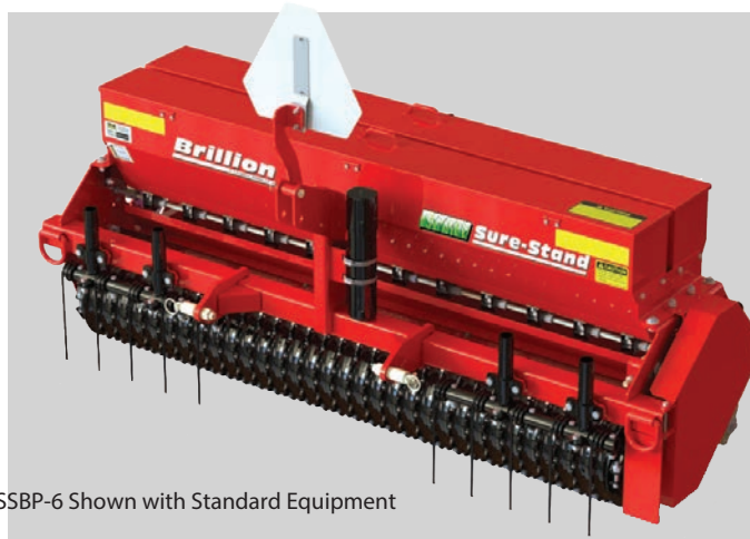
Model SSBP-6 Shown with Standard Equipment

The SS Series of Agricultural Seeders is the industry standard when it comes to planting alfalfa, canola, and grasses. The Sure Stand concept provides precision seed metering and accurate seed depth placement. This combination offers optimum germination. These 4', 5' and 6' three-point hitch models feature a front micro-metered seed box and a rear seed box with the blade agitator metering system.