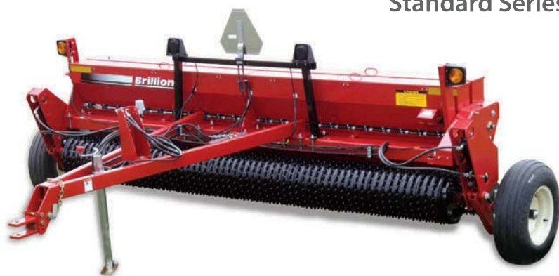
Model SSB-12 Shown with Optional Acre Meter Kit

The SS Series of Agricultural Seeders has been the industry standard when it comes to planting alfalfa, canola and grasses. The Sure Stand concept provides precision seed metering and accurate seed depth placement. This combination offers optimum germination. The Standard Series is offered in both three-point hitch and pull-type models. Pull-type models include all hydraulic equipment including new implement tires.