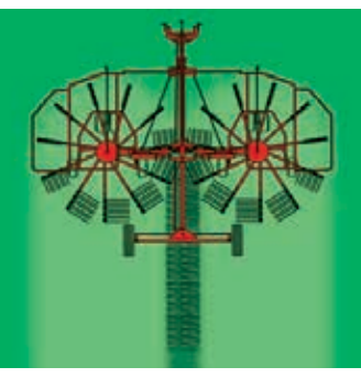
Max. working width: 7,60m (25') Max. Hay width: 1,95m (6'5'')

Min. working width: 6.80m (22' 4") Min. hay width: 1,15m (3'9")