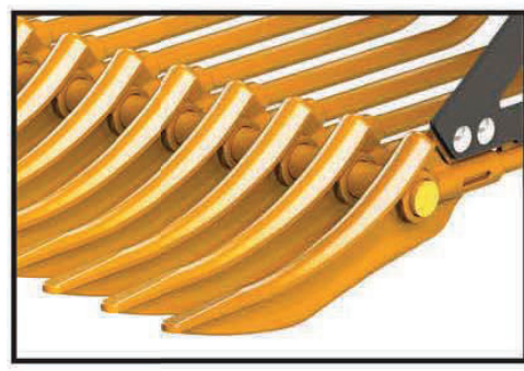
SHoule's model tips are made of cast steel that will not bend or break even under the most rigorous conditions