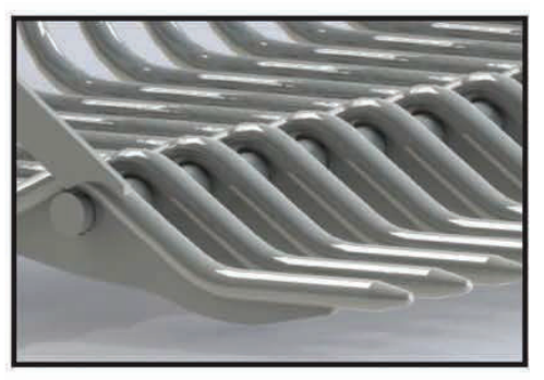
The industry standard tips are shaped with the rod ends which bend over time.