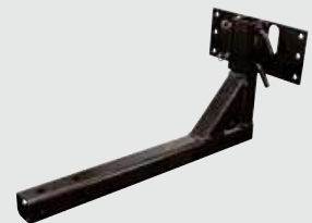
2" Hitch 5301901