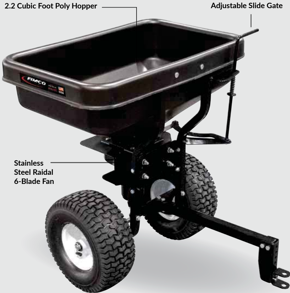
2.2 Cubic Foot Poly Hopper