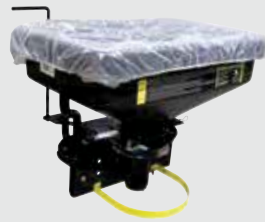
Rain Cover 5058193