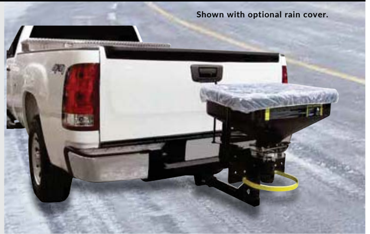
Shown with optional rain cover.

By using the optional receiver hitch mount, the ATV-DMS-12V can easily be attached to a pickup to make de-icing a simple task! And with the dust cover on top, your de-icing material won't get wet or fly out of the hopper.