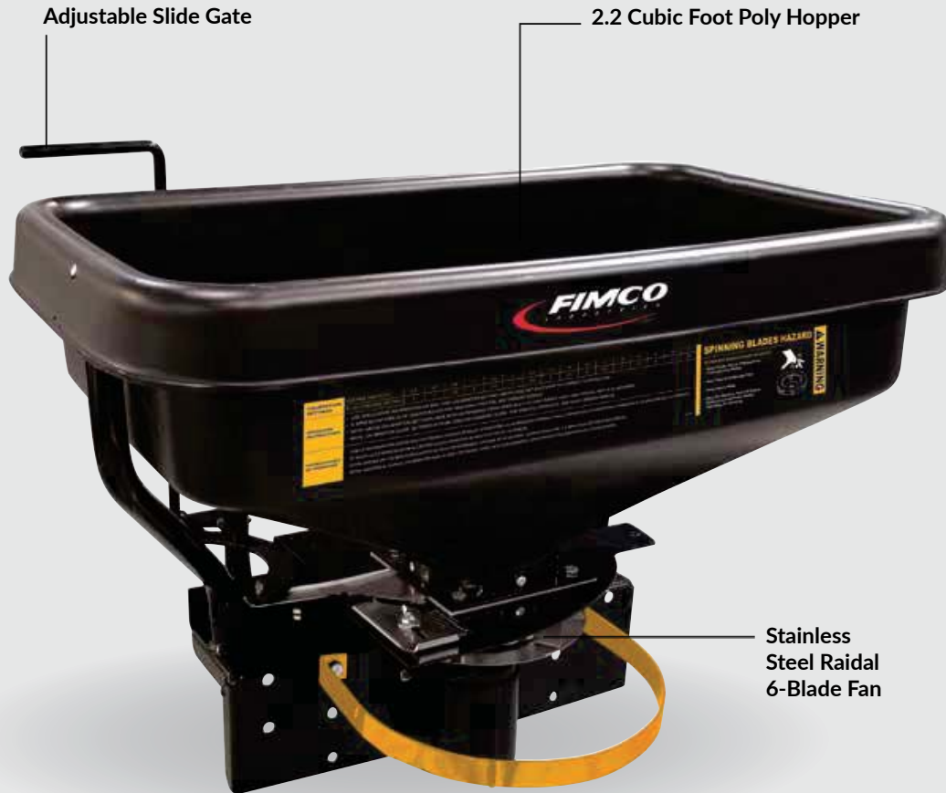
Adjustable Slide Gate