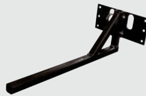
1-1/4" Hitch 5301902